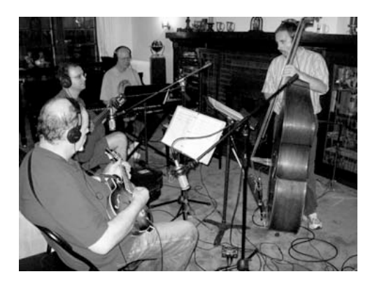
The Knights Tempo Recording Their First CD, Adventures and Romance

The Knights Tempo PO Box 46692 Bedford, Ohio 44146 www.theknightstempo.com 216-702-7107 (Brian) 440-667-4583 (Bob) booking@theknightstempo.com